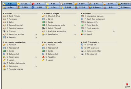
The Financial tab contains all the functions you need for real-time financial insight into your company.